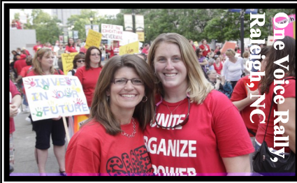
One Voice Rally, Raleigh, NC