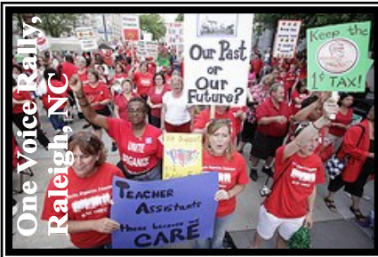
One Voice Rally, Raleigh, NC