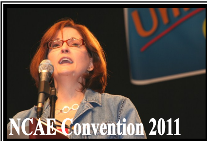
NCAE Convention 2011