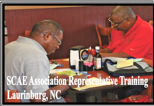
SCAE Association Representative Training Laurinburg, NC