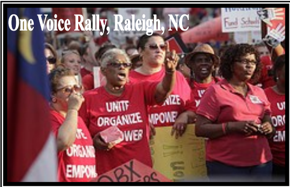
One Voice Rally, Raleigh, NC