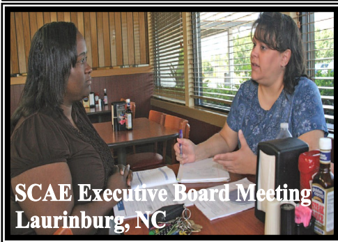
SCAE Executive Board Meeting Laurinburg, NC