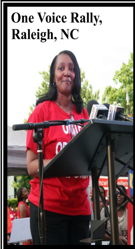
One Voice Rally, Raleigh, NC